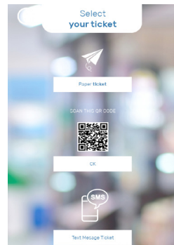
Paper or digital ticket